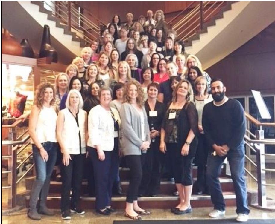
Our 2016 CCFLOBC Symposium delegates